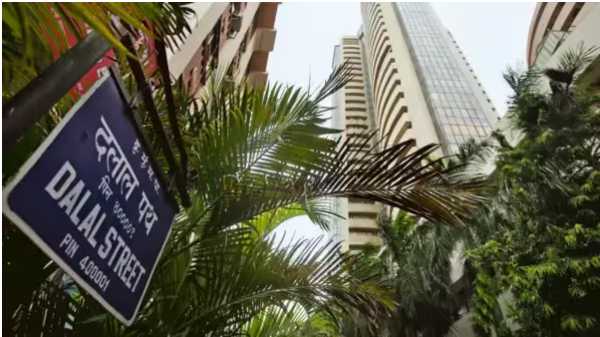
Top Gainers and Losers today

Make a career leap with University of Massachusetts Global MBA